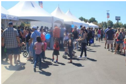
2016 High Desert Book Festival

We hope to also have another newspaper supplement, similar to the 32-page Daily Press newspaper supplement we had in 2016. We will keep you posted on that in terms of advertising options.